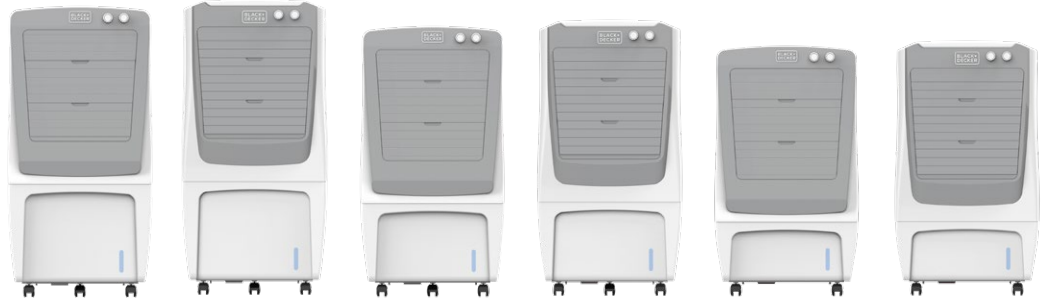
KAMET PLUS 105L BXAC09105IN