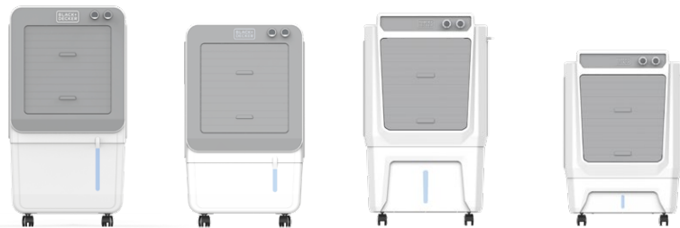
KIBO 45L BXAC03045IN